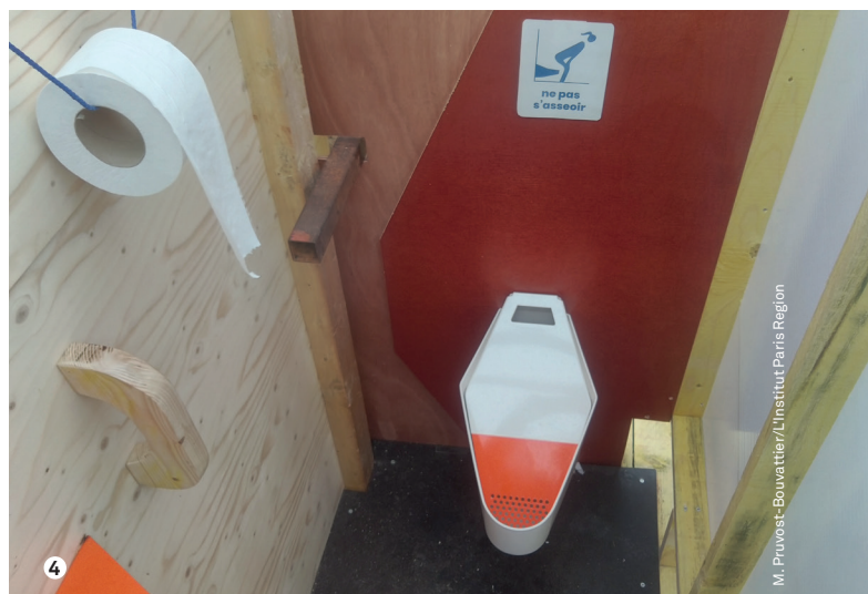
4. "Marcelle" women's urinal allowing urine collection in the Grands-Voiesins development (Paris 14th arrondissement).